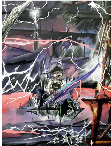
Pierre Aghaikian KingdomHearts2850xmph , 2018 (details)