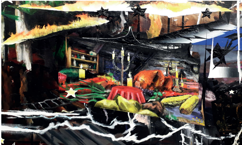
Pierre Aghaikian RedDeadRedemption , 2018 (details)