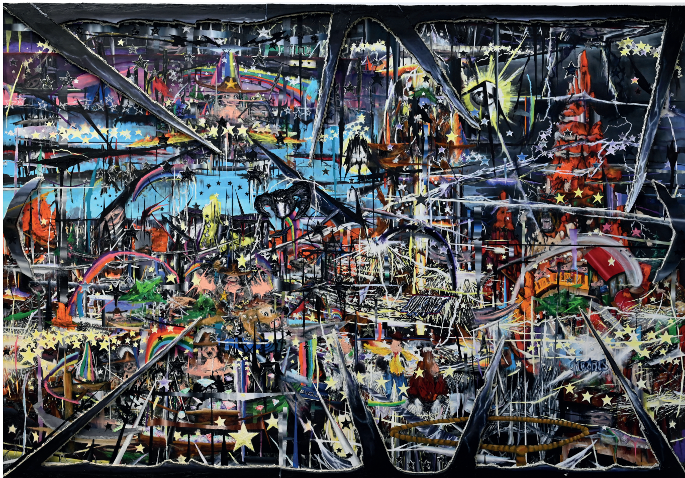
Pierre Aghaikian God sold me another life and he made a prophet 2019 Oil on canvas, polystyrene 230 x 334 cm