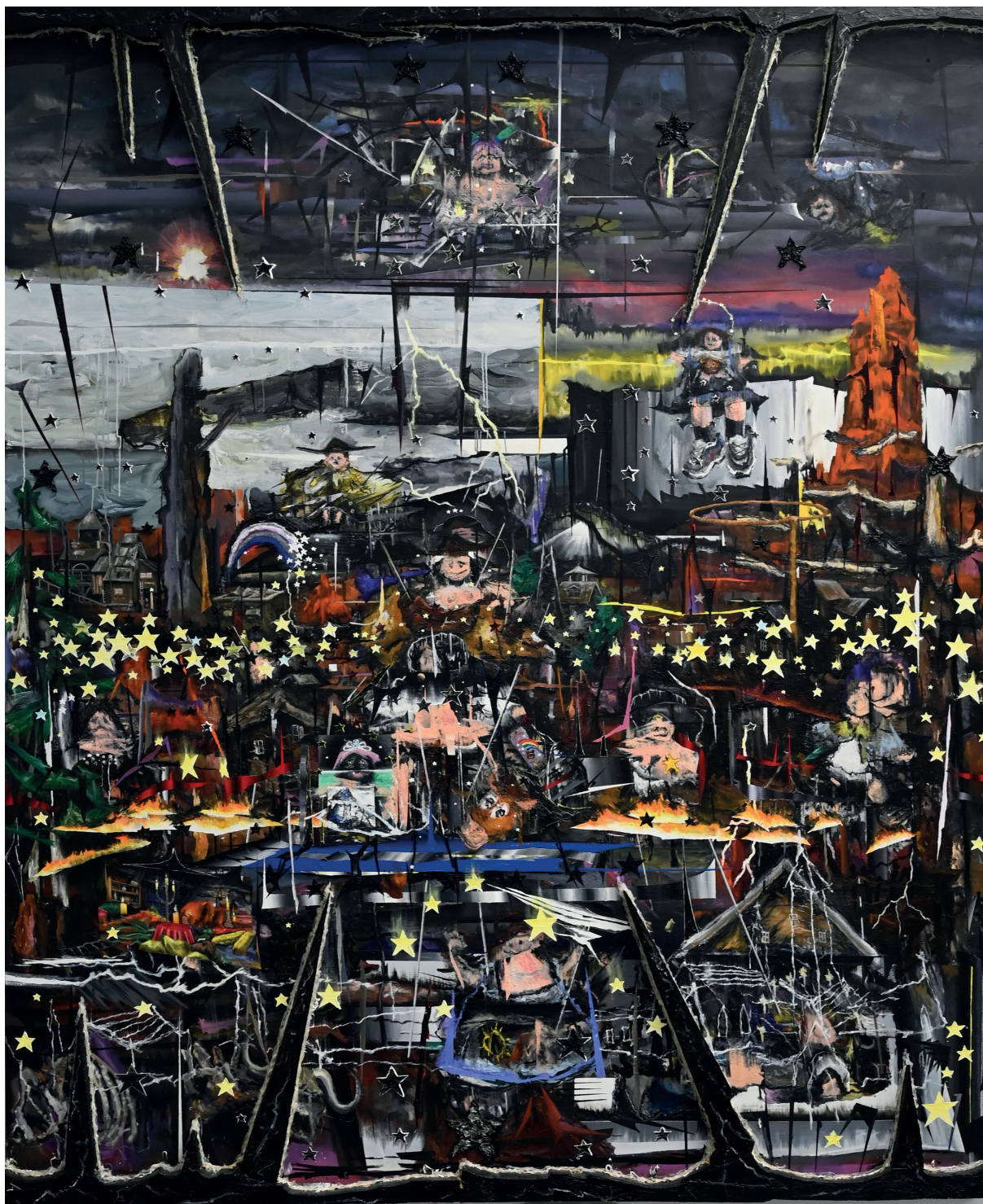
Pierre Aghaikian RedDeadRedemption , 2018 Oil on canvas, polystyrene 275 x 230 cm