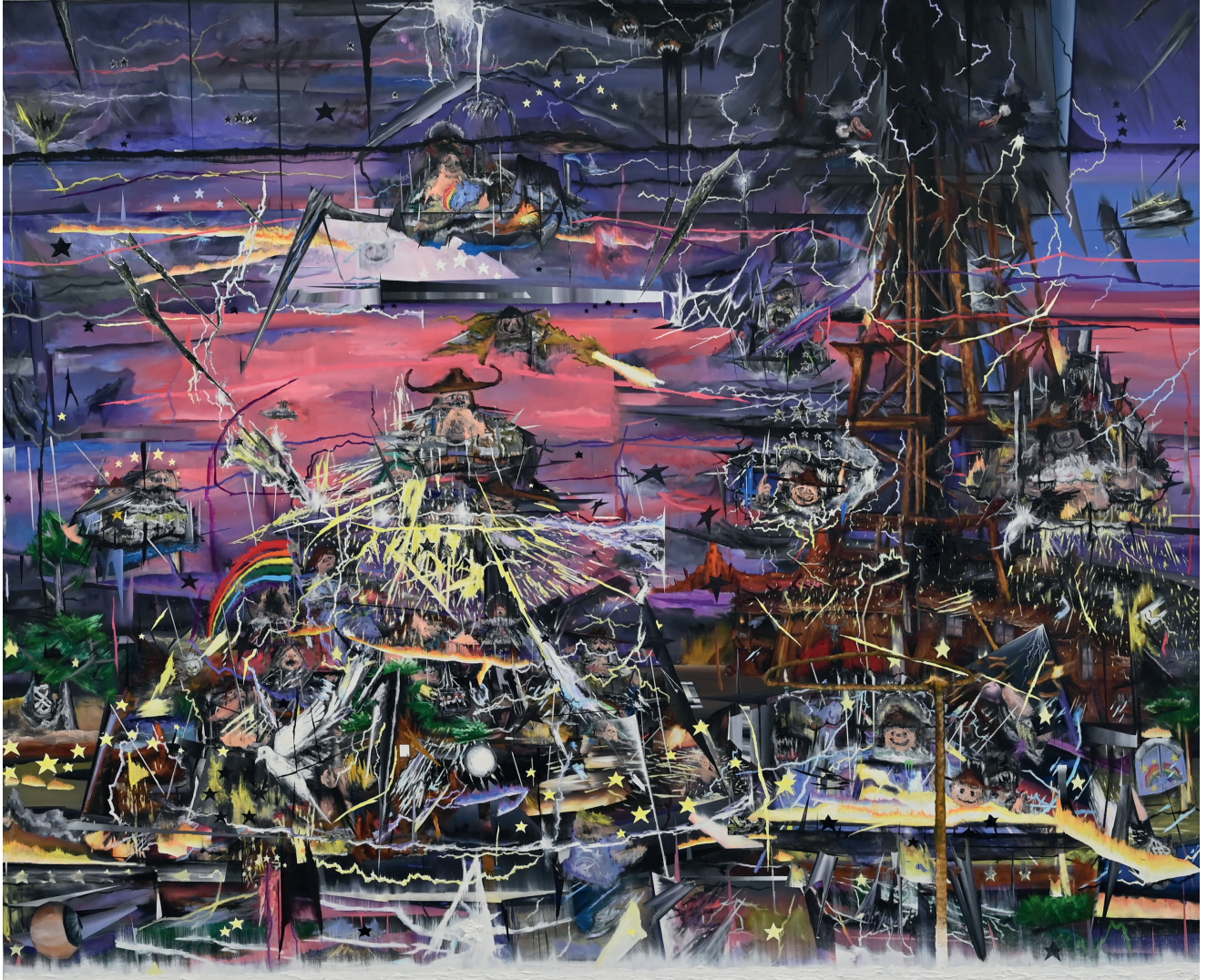
Pierre Aghaikian KingdomHearts2850xmph , 2018 Oil on canvas 230 x 285 cm