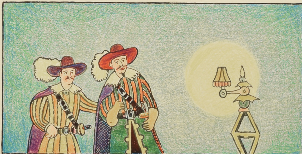
Glen Baxter, Untitled , 2007 Ink and pencil on paper, 27 x 38 cm

"J'EN PERÇOIS TOUT LE POTENTIEL, MAIS POSSÈDE-T-IL LES QUALITÉS INTRINSÈQUES QUI, DANS LES ANNÉES À VENIR, NOUS PERMETTRONS DE L'APPRÉCIER COMME UN VÉRITABLE CLASSIQUE DU DESIGN?"