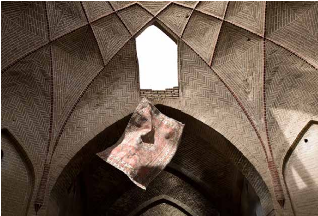
Jalal Sepehr, Knot series, 2011 Digital Photograph, 70 x100 cm / 27.55 x 39.37 in Edition 6/7