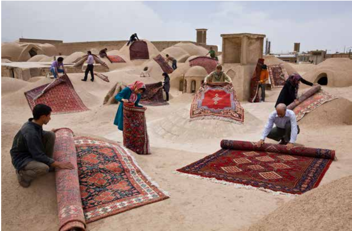
Jalal Sepehr, Knot series, 2011 Digital Photograph, 70 x100 cm / 27.55 x 39.37 in Edition 6/7