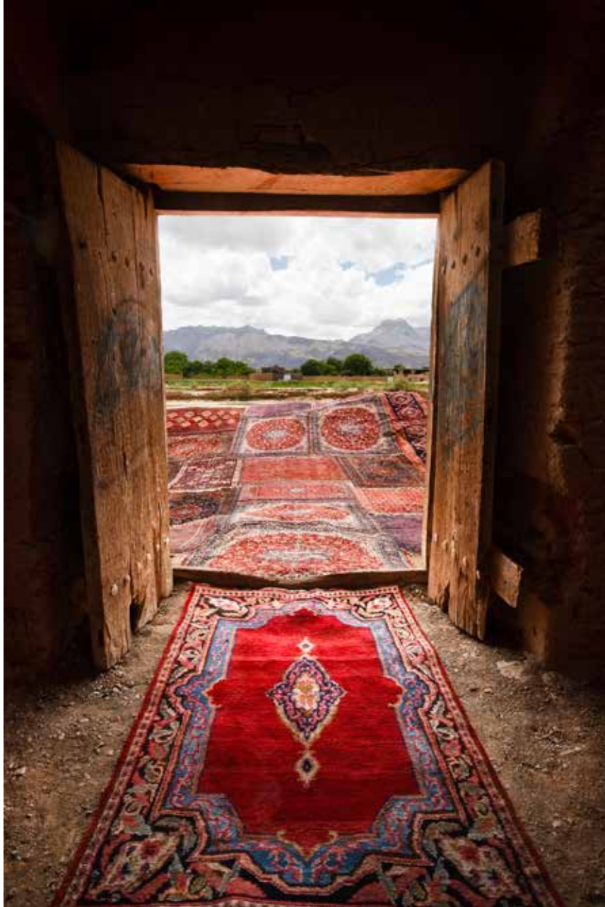
Jalal Sepehr, Knot series, 2011 Digital photograph, 100 x 70 cm / 39.37 x 27.55 in Edition EA/2