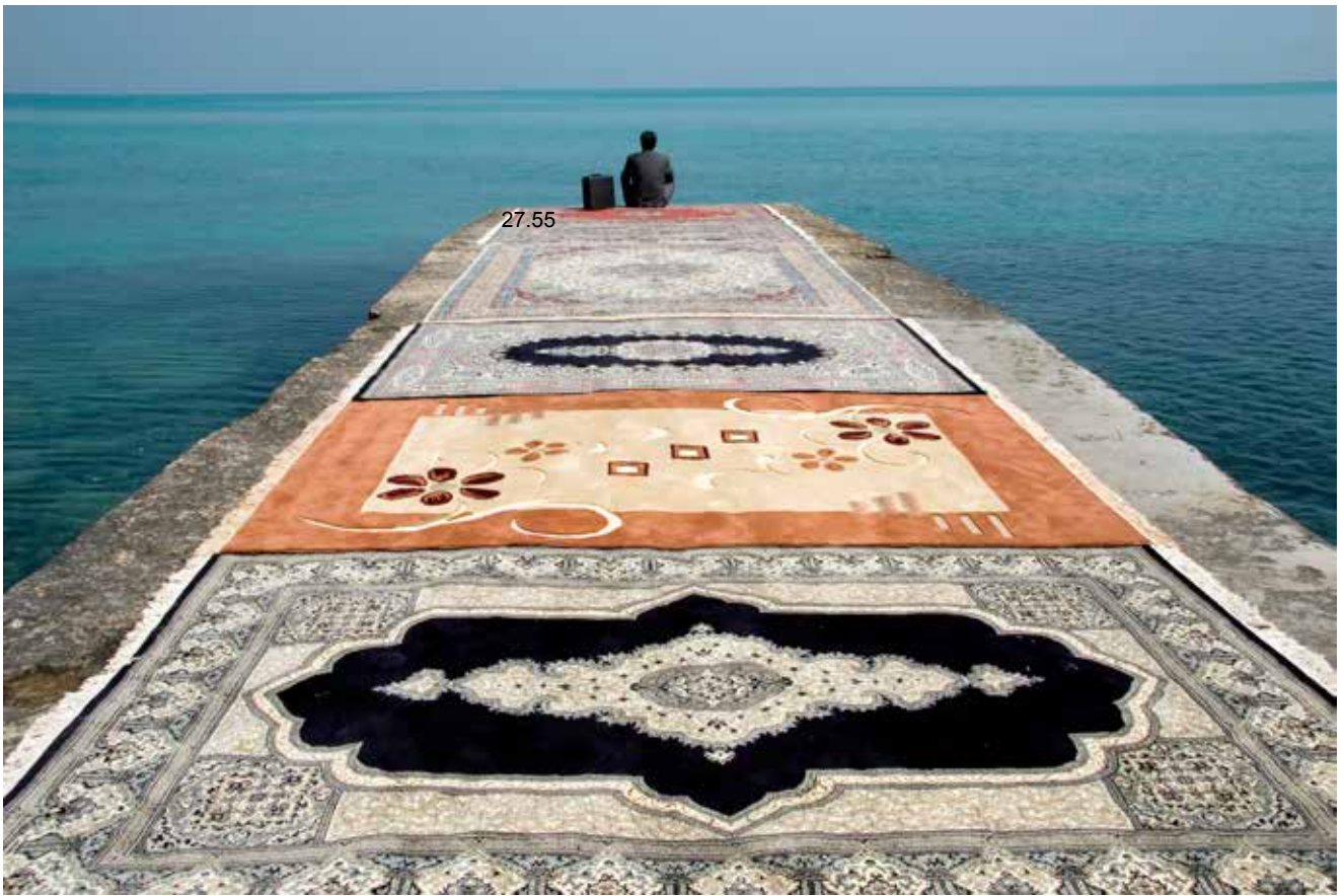
Jalal Sepehr, Water and Persian Rugs series, 2004 Digital Photograph, 70 x100 cm / 27.55 x 39.37 in Edition 10/10