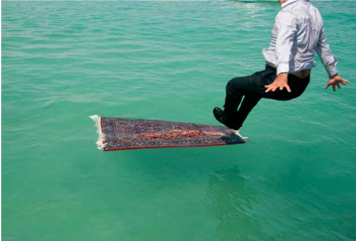
Jalal Sepehr, Water and Persian Rugs series, 2004 Digital Photograph, 70 x100 cm / 27.55 x 39.37 in Edition 6/10