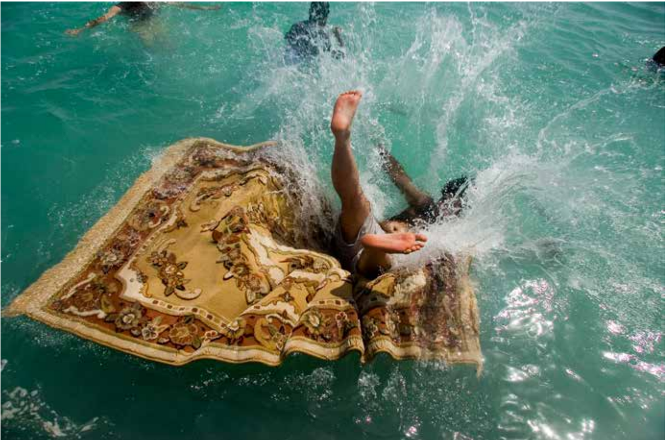
JJalal Sepehr, Water and Persian Rugs series, 2004 Digital Photograph, 70 x100 cm / 27.55 x 39.37 in Edition 6/10